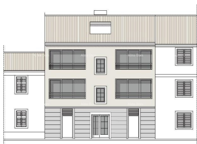
SJEVEROISTOČNO PROČELJE MJ=1:100